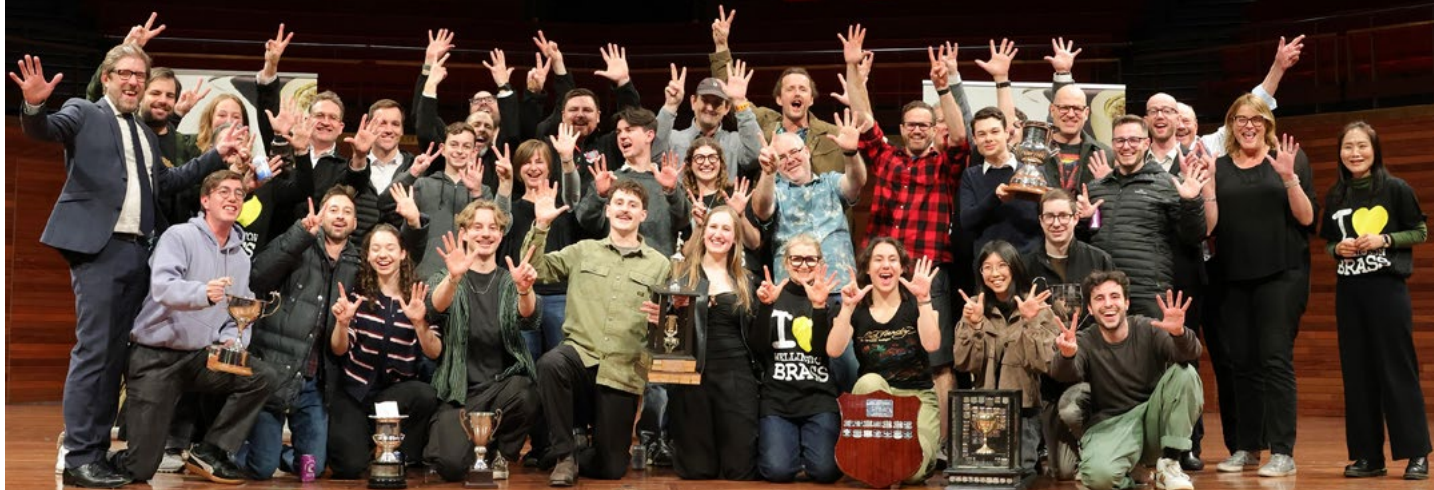
Wellington Brass - making history with a seventh consecutive A Grade Championship win.

New Zealand Mouthpiece is proudly sponsored by JP Musical Instruments | www.musicways.co.nz | 09 477 0384 | info@musicways.co.nz