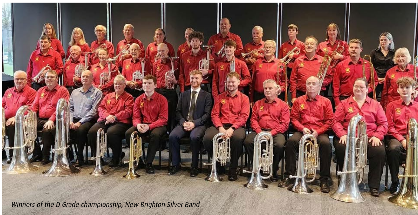
Winners of the D Grade championship, New Brighton Silver Band